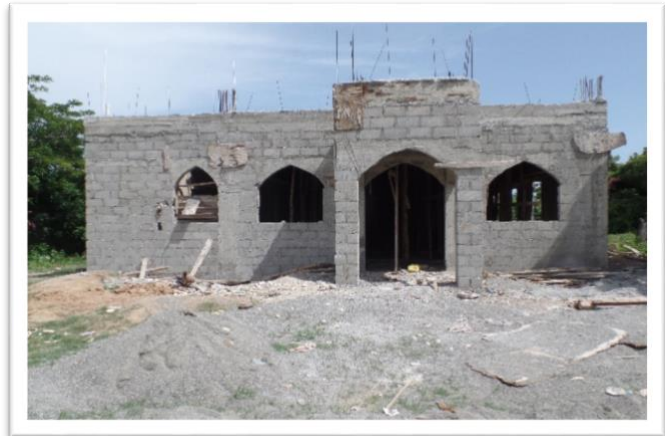
The Progression of the San Timoteo Church