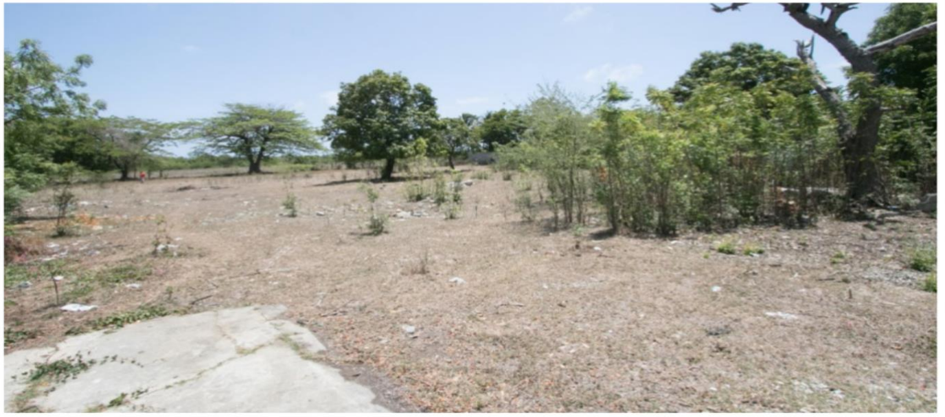
The land to be used for an agricultural cooperative

To best utilize the land the Bishop plans to begin an agricultural cooperative to work with families in the community to grow their own fruits and vegetables. The excess crops harvested can be sold to provide income to those families.