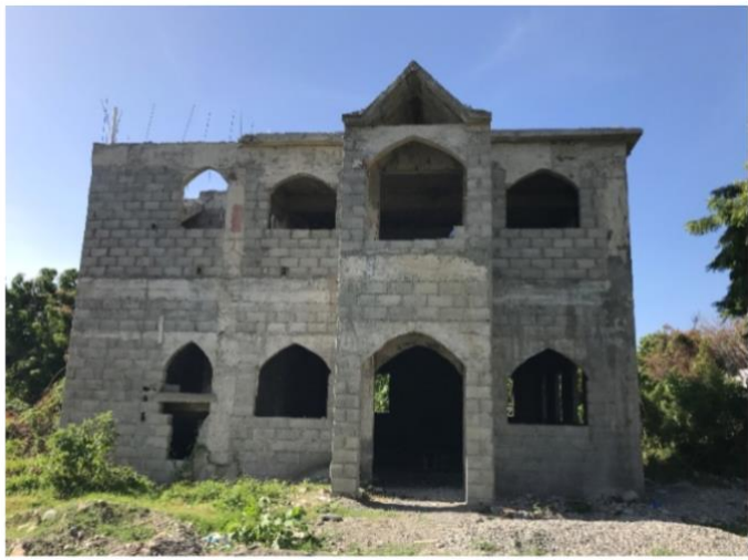
The New Iglesia Episcopal San Timoteo

The Tampa Deanery project for 2018 is the third and final year of our project to build the new San Timoteo Episcopal Church in the town of Nizao. Our teams will also work at the San Matías School in Santana, Bani where they will complete much needed repairs, including painting and carpentry.