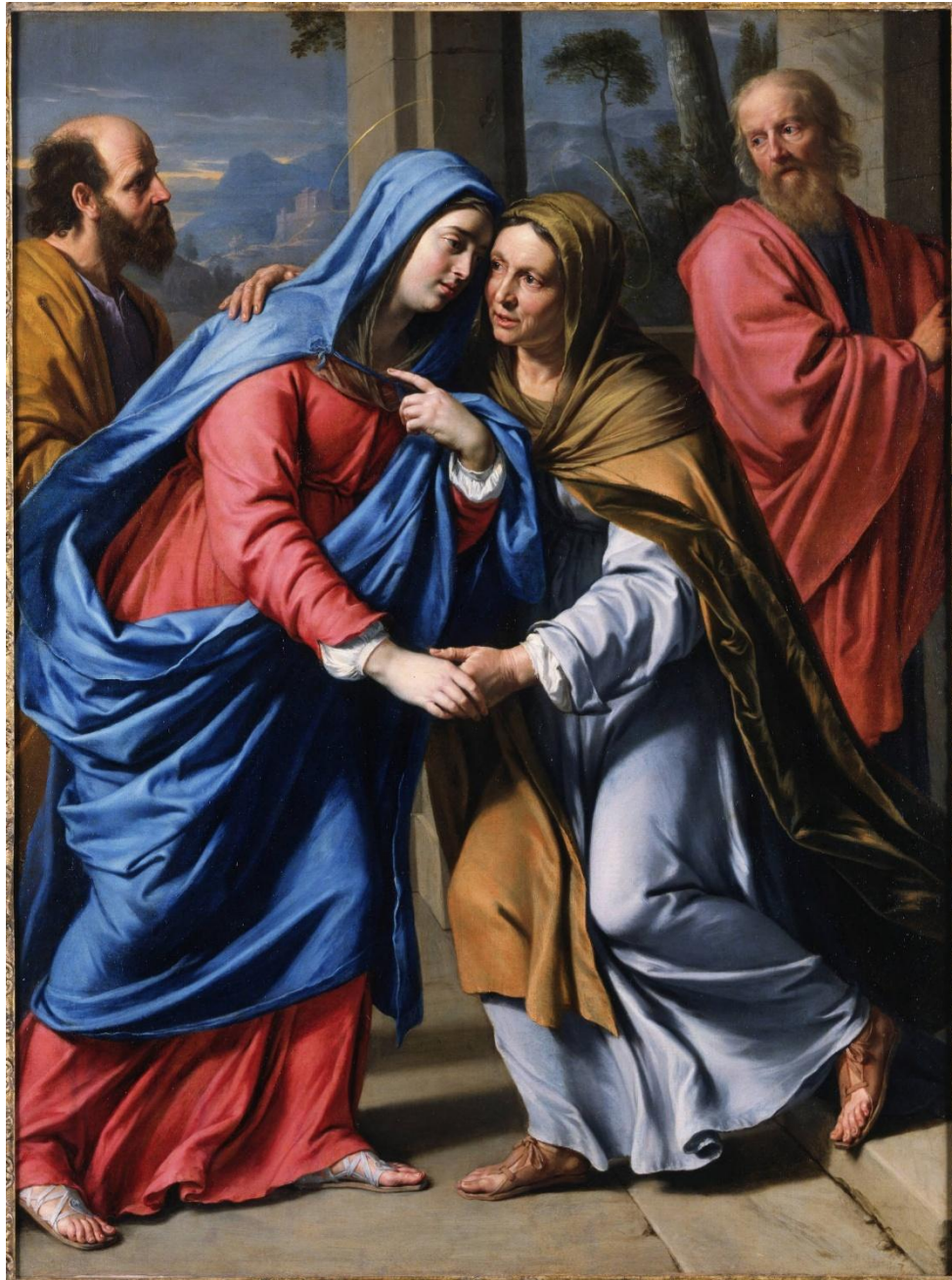
Philippe de Champaigne, The Visitation , oil on canvas, 1643-1648, Princeton University Art Museum.