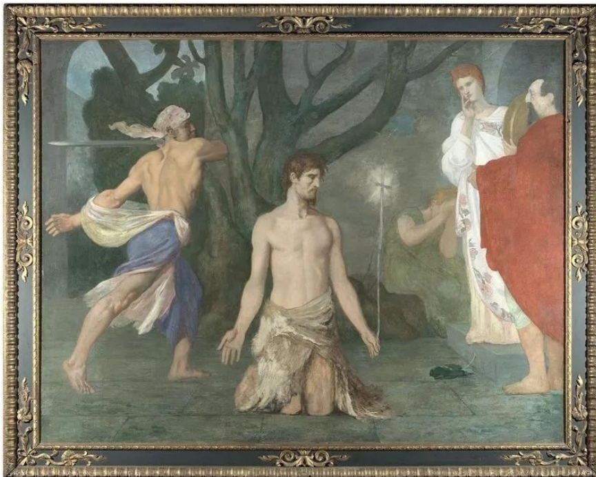
Photo Credit: The Beheading of Saint John the Baptist, Painting by Pierre-Cécile Puvis de Chavannes (1824-1898), Painted circa 1869, Oil on canvas

The Candle in the Sanctuary Light is given to the Glory of God in thanksgiving for all blessings, seen and unseen.