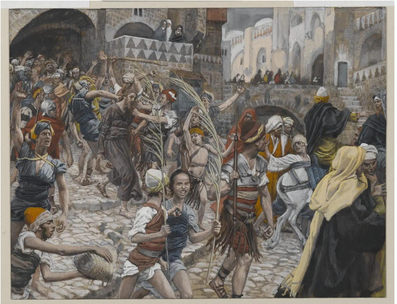
James Tissot, Jésus conduit de Caïphe à Pilate (Jesus Led from Caiaphas to Pilate), watercolor on paper, 1886-1894, The Brooklyn Museum.

Palm Sunday is a time of mixed sentiment because, although initially triumphal, as the liturgy progresses we are taken through the events of Holy Week, leading to the arrest and crucifixion of Jesus. Just a few days after entering Jerusalem for the last time the same crowds which warmly welcomed Jesus as the Messianic King were now calling for him to be killed. Palm Sunday, then, is a time for Christians to reflect on their faith and to prepare themselves for the solemnity of coming Holy Week, which culminates in the celebration of Easter and the resurrection of Jesus.